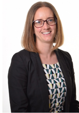
Message from The Principal

Year 9 Options is the very start of the next chapter of your educational journey here at Egguckland Community College. As you prepare to graduate from Key Stage 3, you now have the chance to start to specialise in the subjects you are most interested in and enjoy the most.